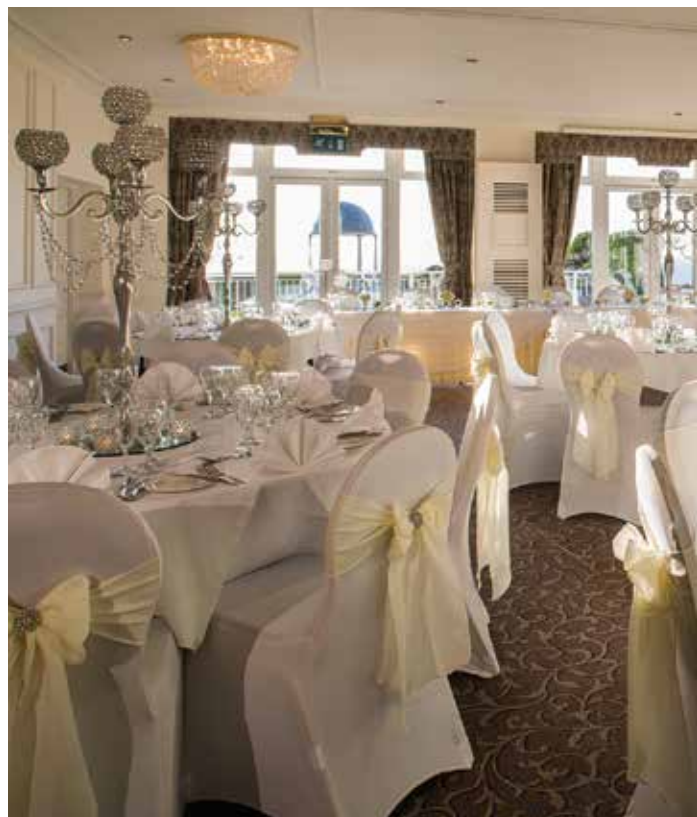
THE GARDEN SUITE

Prices per adult based on a minimum number of 50 adults on Friday, Saturday and Sunday.