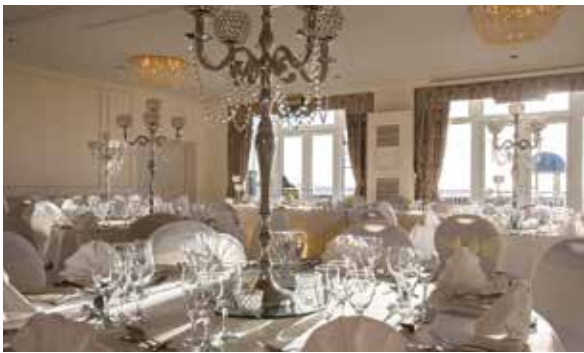
THE GARDEN SUITE