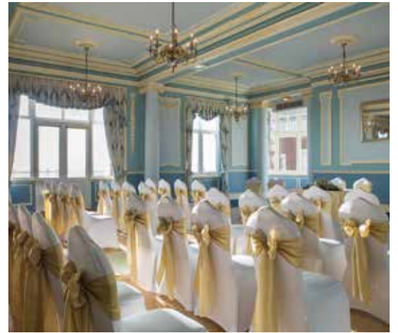
THE WEDGWOOD BALLROOM