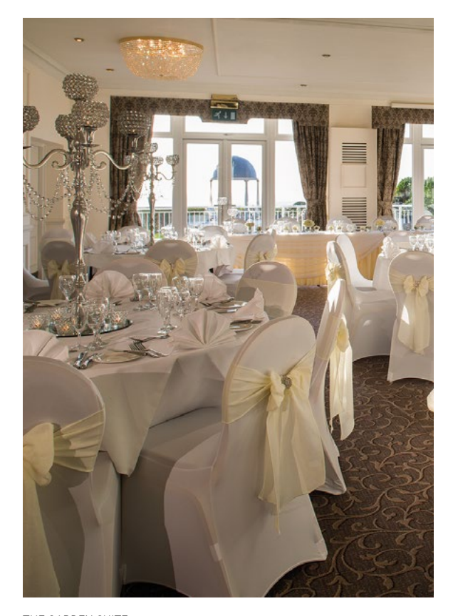
THE GARDEN SUITE