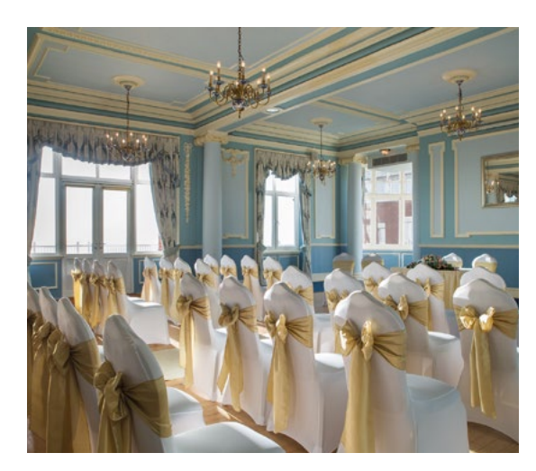
THE WEDGWOOD BALLROOM