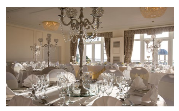
THE GARDEN SUITE