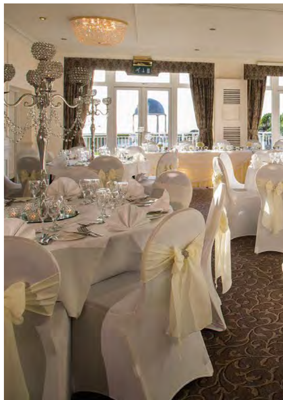
THE GARDEN SUITE