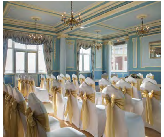
THE WEDGWOOD BALLROOM