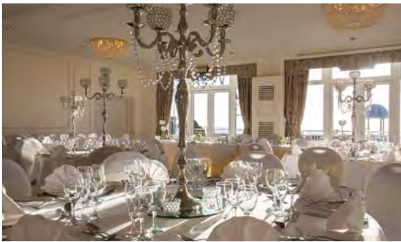
THE GARDEN SUITE