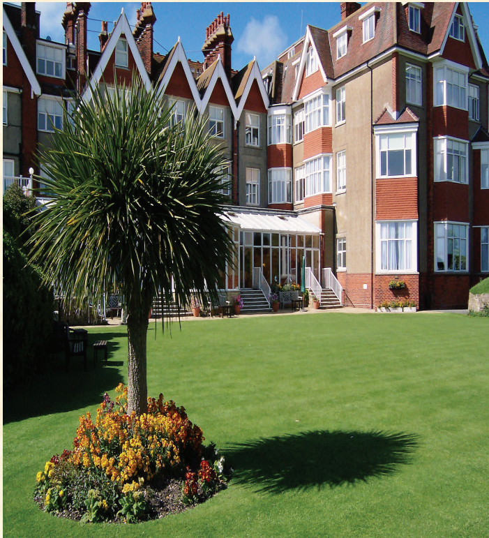
Large Garden setting with Sea Views & Unrestricted free parking surrounds the Hydro

BAKERS SELECTION ~ Crusty Bread Rolls - Brown and White